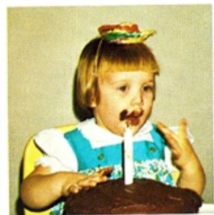
Color prints, like the one above (shown half-size), can be produced from KODACOLOR-X and other color films.